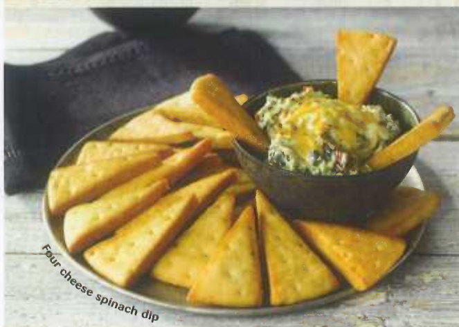
Four cheese spinach dip