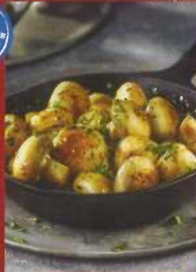
Skillet of Sizzling Mushrooms